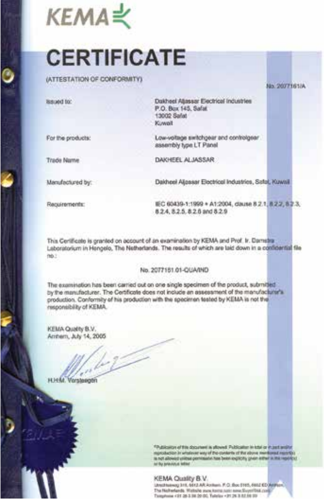
KEMA Certificate for LT Panel